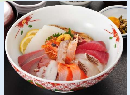
The Best Seafood Don by 『Seafood House - Fukushin』