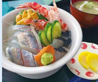
Five Kinds of Seafood Don by 『Marukei Fish Market』