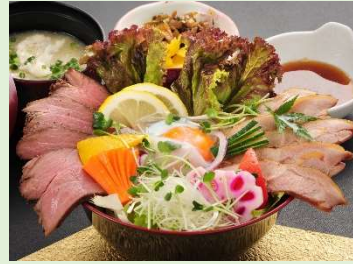
Amakusa Daio & Roast Beef Don by 『Misaki-tei Restaurant Orion』