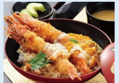
Fried Tiger Prawn with simmered eggs Don by 『Garden Place - Shio Maneki』