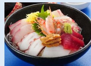
Seafood Don made by the fresh seafood market 『Restaurant Mankai』