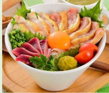
Amakusa Daio "the Best Raw Chicken" -Oyako Don - by 『Amakusa Daio Baru Sun-Hara-Ippai』