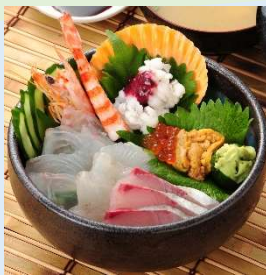
Sun Pearl Don - by 『Michi-no-eki Kamiamakusa Sun Pearl』