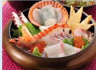
Local Seafood Don by 『Suiten』