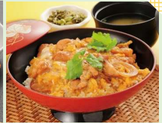
Amakusa Daio Oyako Don by 『Garden Place - Shio Maneki』