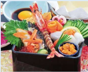
Seafood Don by 『Misaki-tei Restaurant Orion』