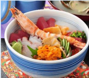
Seafood Don by 『Misaki-tei Restaurant Orion』