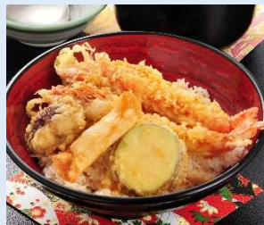
Fried Tiger Prawn Don with salt soup of Amakusa Daio Chicken - by 『Tenshin』 the main restaurant