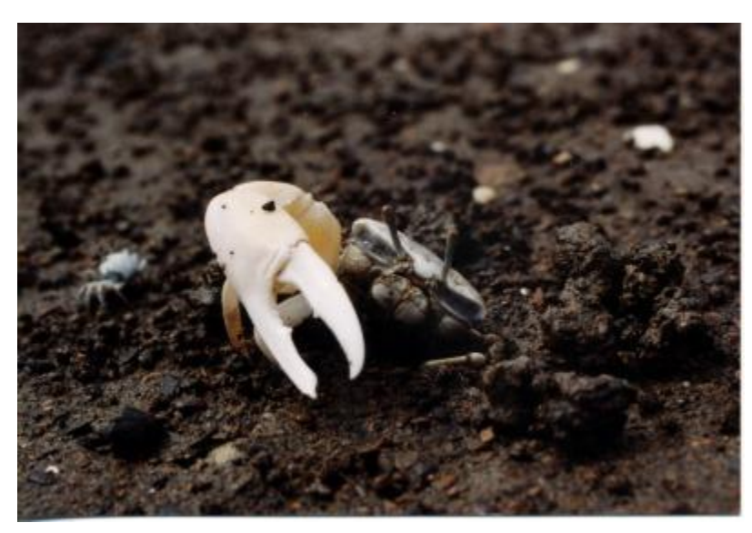
Uca lactea, Milky Fiddler Crabs (Hakusen Shiomaneki)