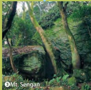
3 Mt. Sengen