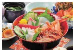
Rice bowl with plenty of Amakusa's delectable seafood (at Matsushima Kanko Hotel Misakitei Restaurant)

Find many kilns that produce heartwarming crafts using the region's special Amakusa Toseki.