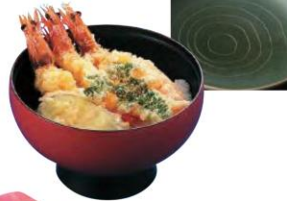
Rice bowl with three tempura Kuruma Prawns (at Fukushima)

Find many kilns that produce heartwarming crafts using the region's special Amakusa Toseki.