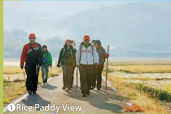
1 Rice Paddy View

Enjoy the Breathtaking Landscape which Words Cannot Describe