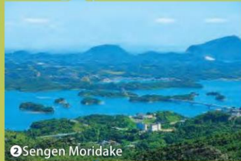
2 Sengen Moridake